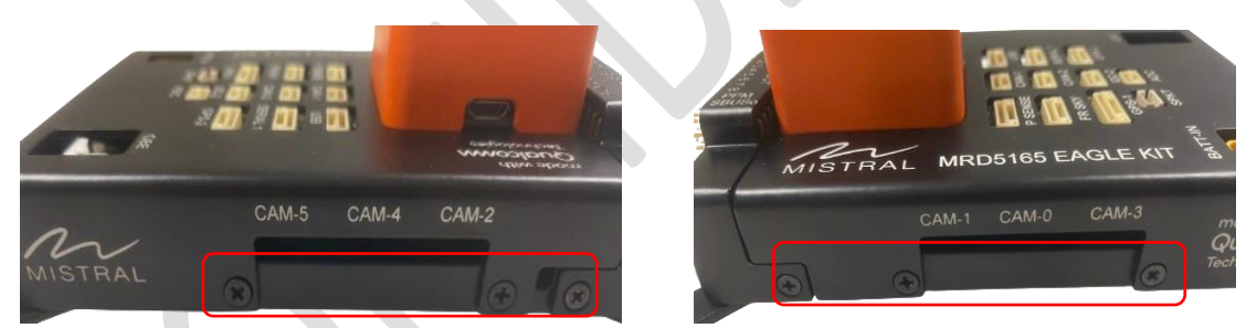
Step 3: Take off the top enclosure plate.

Step 2: For the integration of the camera adapter in the Eagle Kit, locate the mounted screws on both the left and right sides and remove screws using PH1 size star screwdriver, as depicted in the image below.